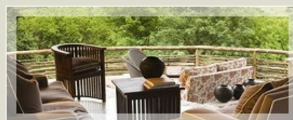
Sea and Safari