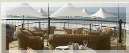
5 Night Weekend

Take advantage of four, fabulous packages on offer. All packages are subject to availability. Excludes peak period of 22 December 2010 to 3 January 2011. Call 031 561 2211 or email beverlyhills@beverlyhillshotel.co.za to book.